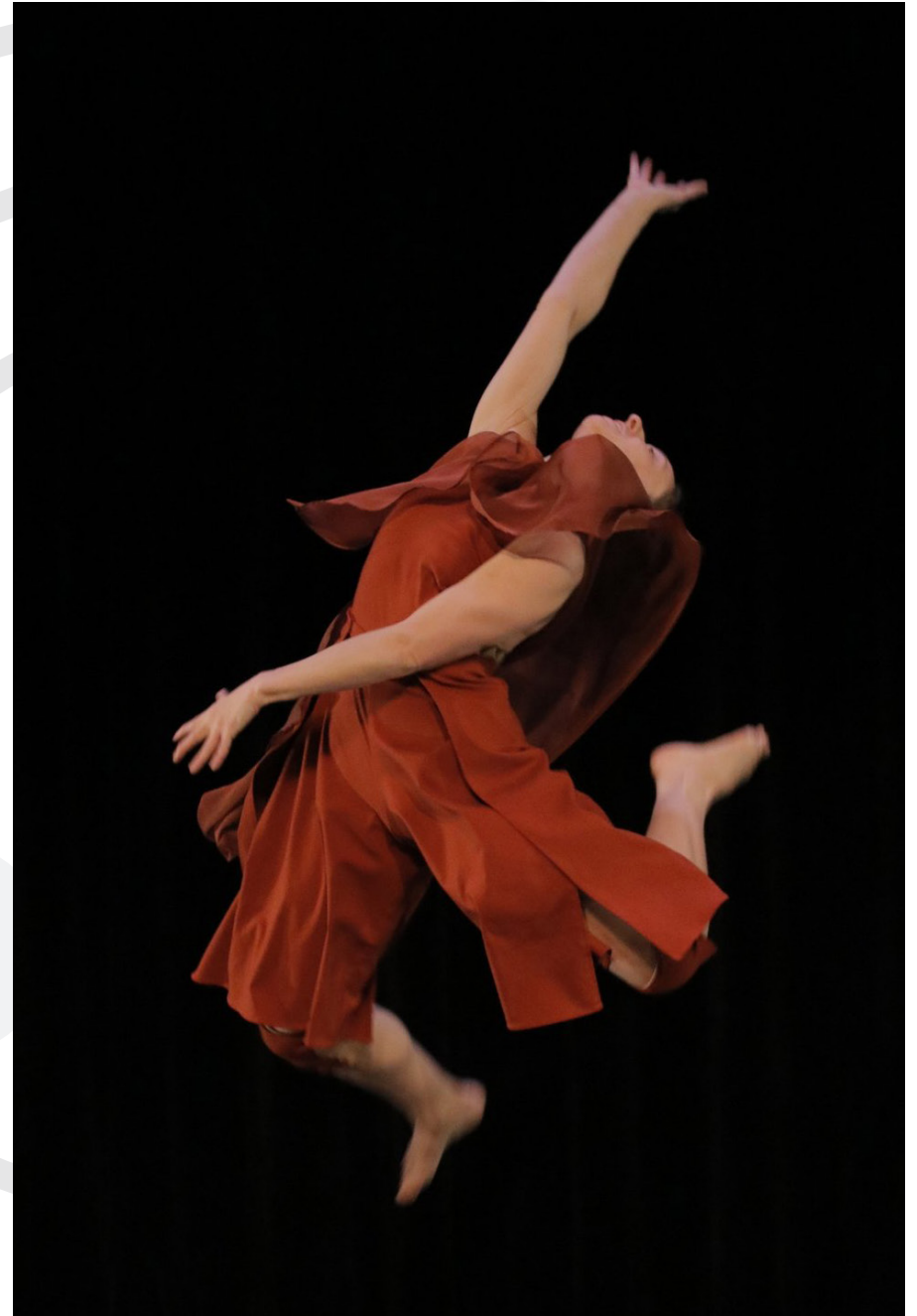
Co. Erasga, photo: Yasuhiro Okada