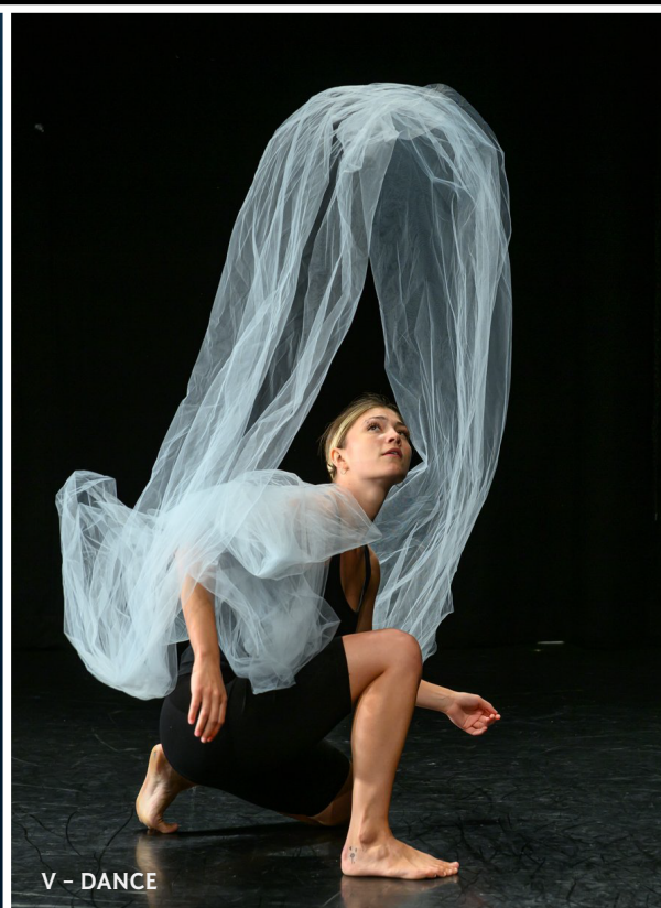
V - DANCE