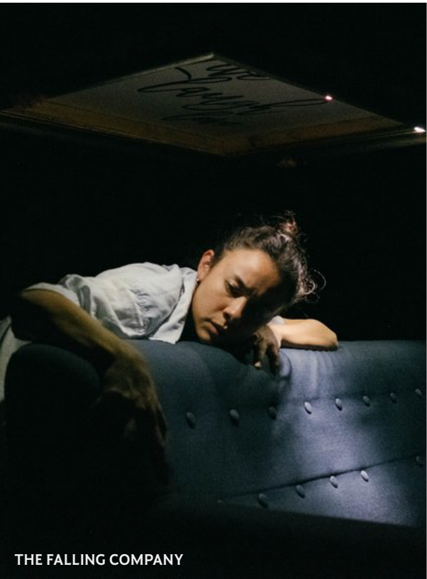
THE FALLING COMPANY