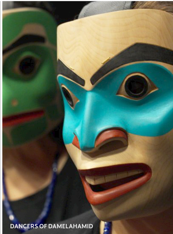
DANCERS OF DAMELAHAMID